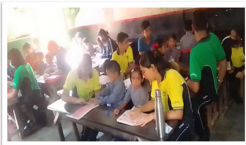
Student exchange programme