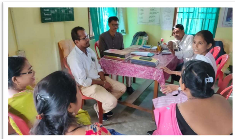
Teacher interaction programme