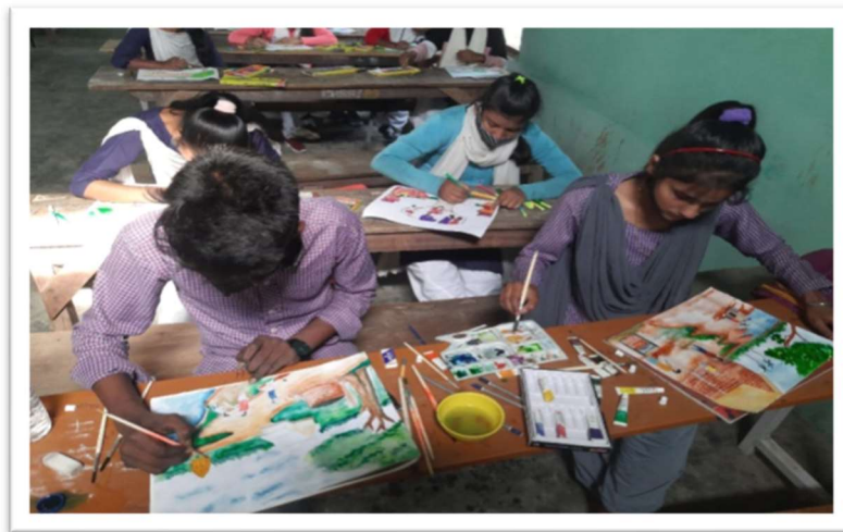
Drawing and painting competition